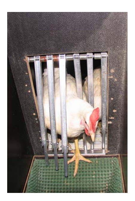
Figure 3: A hen in three phases: entering the nest, staying inside and leaving the nest.

in pens for 360 hens, equipped with Funnel Nest Boxes. Daily nest visits were recorded with oviposition time for each hen during a period of up to one year. On the basis of the recorded number of nest eggs per hen, a family breeding value can be estimated for egg production, taking into account nest acceptance, which is then combined with traditional selection criteria in a selection index.